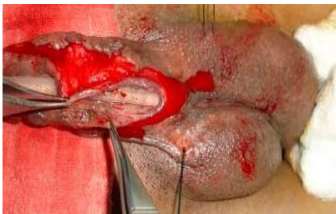
Figure-2 Graft incised