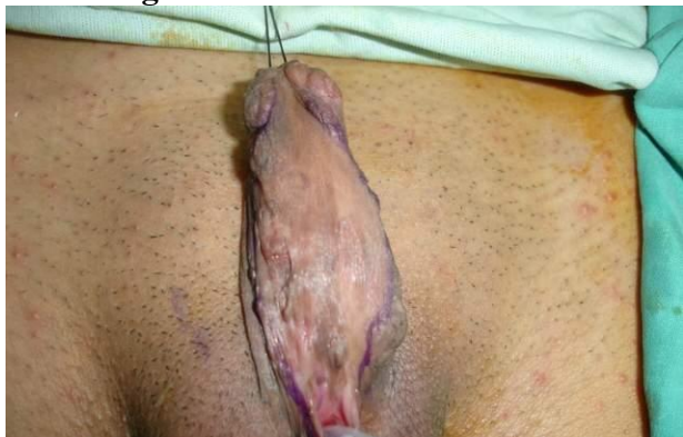
Figure-1 Second stage Bracka's Repair graft marking for tubing