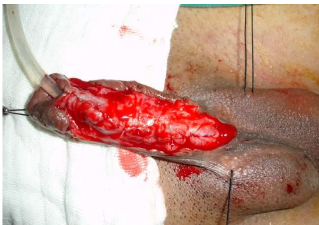
Figure-3 Tubularization done