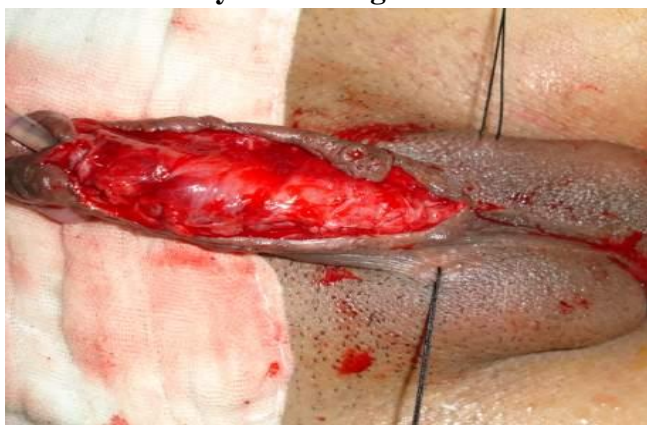
Figure-5 Intermediate layer covering neo-urethra